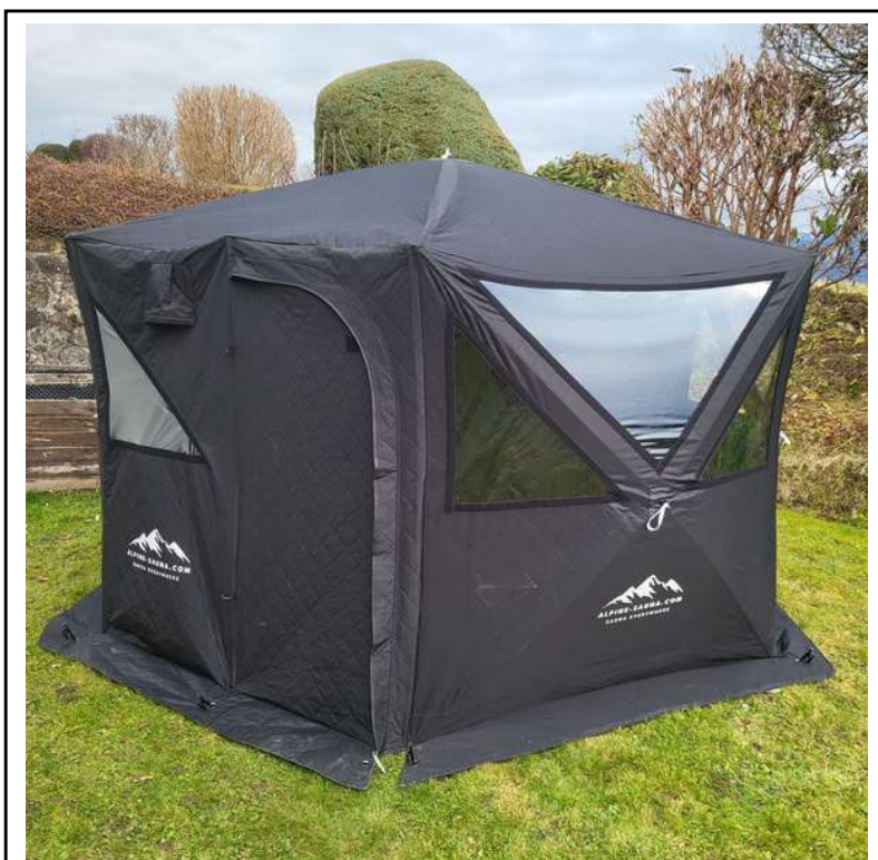
Assembled sauna tent