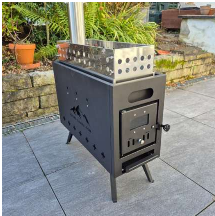
Built-up sauna stove